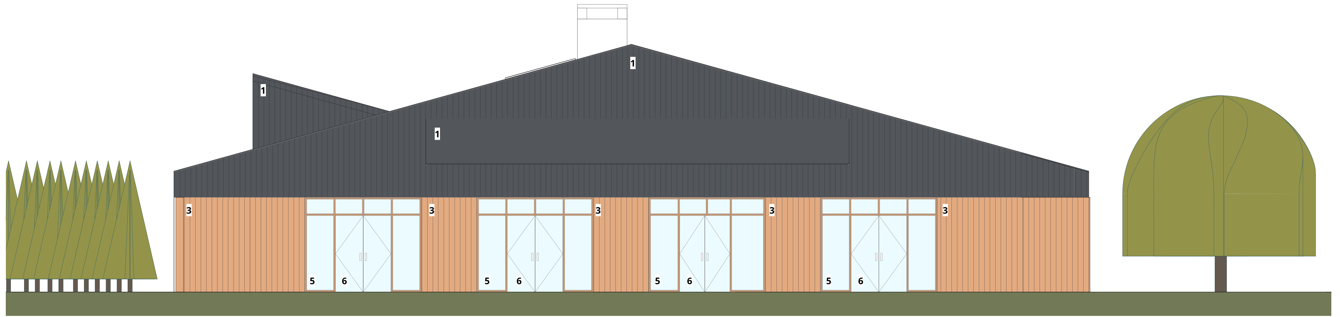
East - As Proposed 1:50