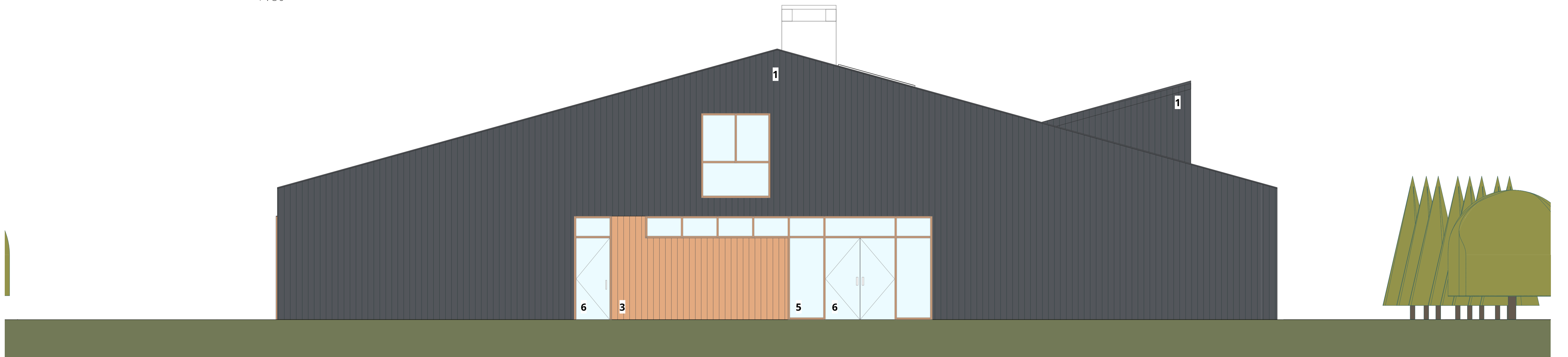
West - As Proposed 1:50